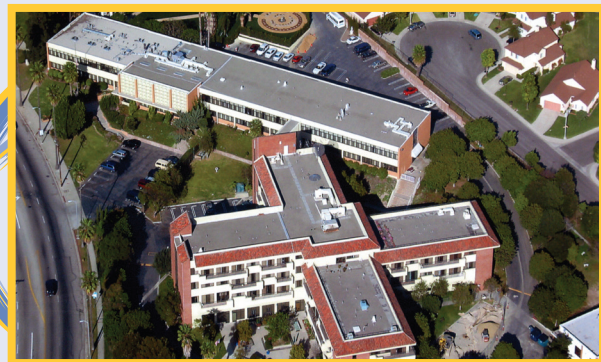
The Little Sisters of the Poor provide a loving Home for nearly 100 elderly. They have served in Los Angeles since 1905.

Roof Repair: There are a number of water pockets on the Apartment Building and Chapel Roof. A complete water penetration check and