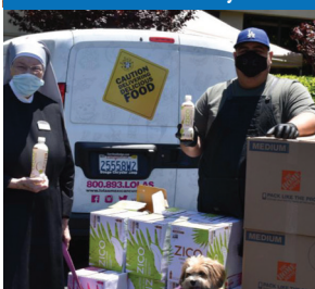
World Central Kitchen