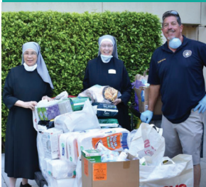
Mary Star Elementary School