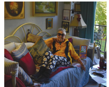
Verla ~ Having Fun Posing for Pictures