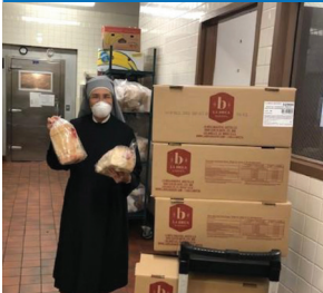
La Brea Bakery