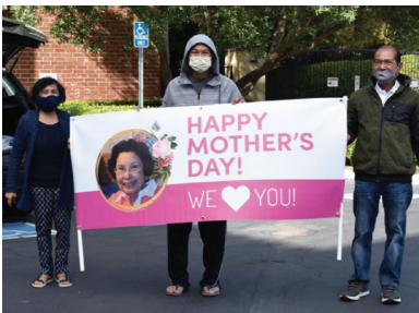
The Inez Family ~ Family Social Distancing Celebration