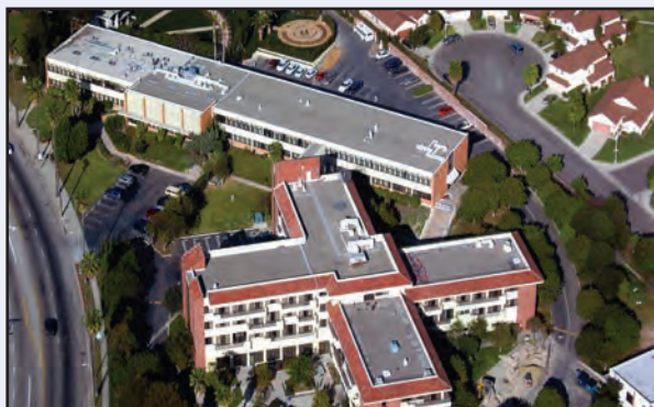
The Little Sisters of the Poor provide a loving Home for nearly 100 elderly. They have served in Los Angeles since 1905.

The fire alarm and nurse call systems share the same annunciation lights and many of the same wiring paths. Combining the upgrade for these two obsolete systems into one cohesive project is both necessary and cost effective.