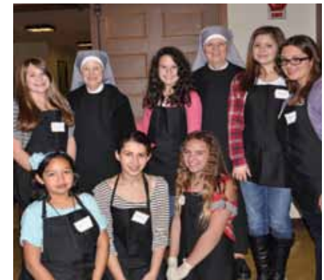
We thank the youth from Holy Trinity School who generously volunteer to serve at various events at our Home.

Many of us are only familiar with the big international World Youth Days that occur every 2-3 years in a major world city. But this Palm Sunday is World Youth Day in dioceses around the world. The theme is: "Always be joyful in the Lord!", taken from the Letter of St Paul to the Philippians (4:4). We will celebrate the day with the participation of a youth choir during our Sunday Mass.