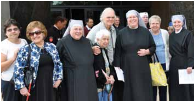
Those who arrived first from San Pedro waited at the door of the Cathedral to be joined by the others.