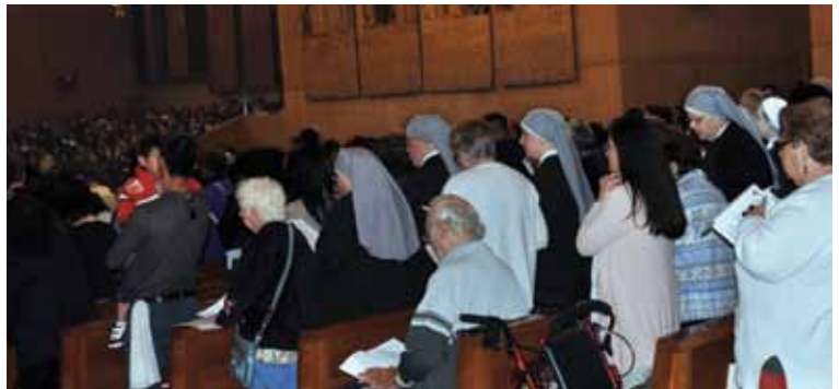
The Cathedral was filled to capacity but we were able to sit together. Our Residents in wheelchairs were altar side!